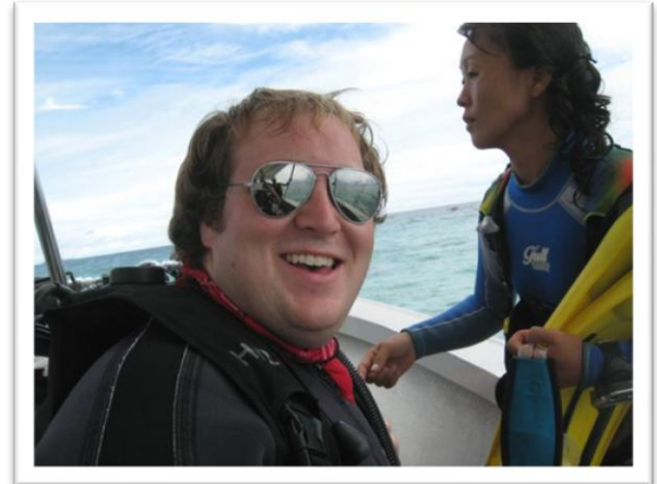
About to go SCUBA diving. The whole experience was awesome! It's another world under the surface.

special treat. It only required a brief training session, and then we were allowed to dive to a depth of 12m (40 feet). Although it can be dangerous the whole experience was worth it. I will definitely dive again (Great Barrier Reef??).