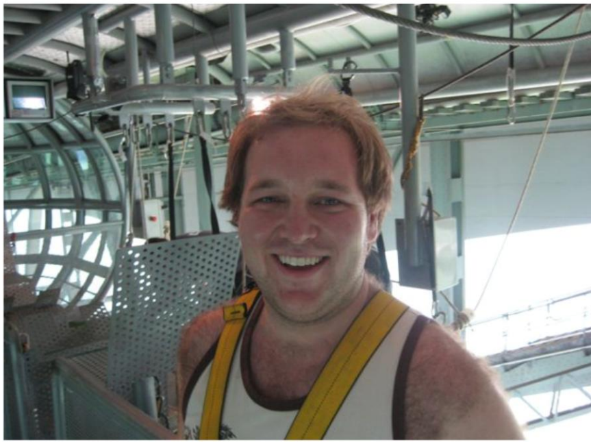
Just prior to my jump in Auckland. If you are ever there.... make sure you do it!

Just because there is an ocean between us, does not mean that I am out of contact. There is only a 3 hour difference in time between us (technically a day and three hours...). Meaning when it is 8PM Pacific it is 5PM (the next day) in New Zealand. I'm also able to video conference through Skype; my username is "smyoss". Look me up.