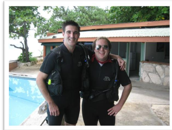
After the dive. Were pretty much experts now...