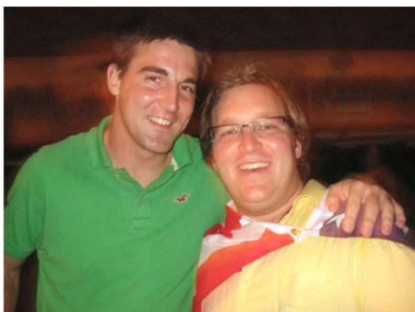
The resort had hermit crab races. Each crab was named after a country. Guess which country we were supporting... Somehow the USA crab didn't win. I petitioned to have the other crabs tested for steroids.