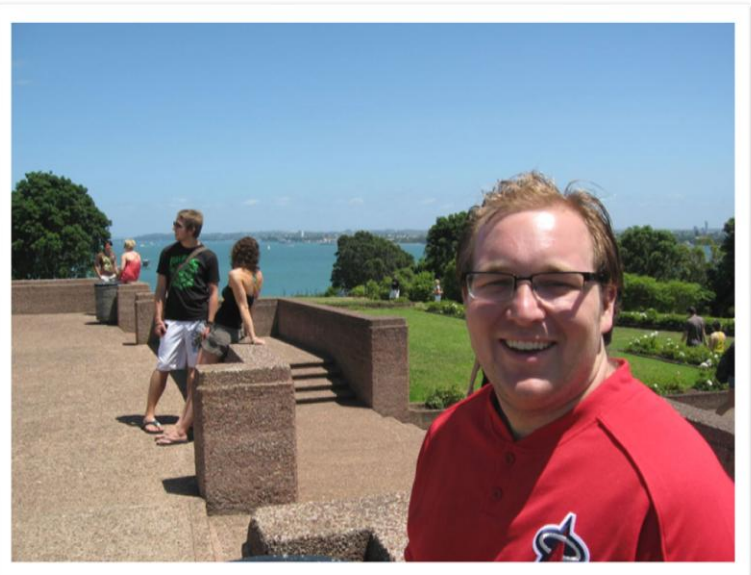
Auckland political landmark site overlooking the city. As always... supporting my beloved Angels.